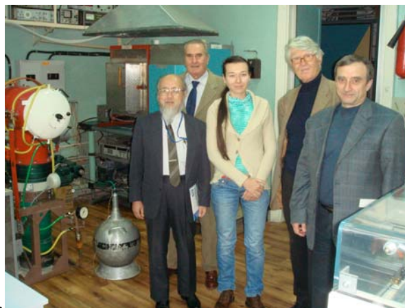
In the Institute of Solid State Physics RAS.