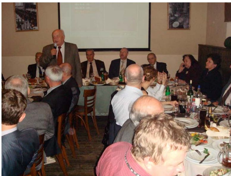
Celebrating of the 20th Anniversary of Scientific-Educational Center of SHS MISIS-ISMAN.