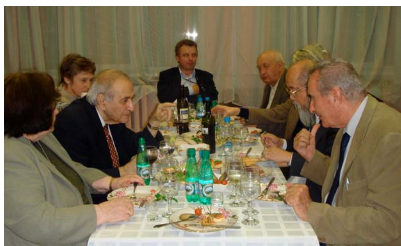
Discussion in ISMAN continued during the dinner.