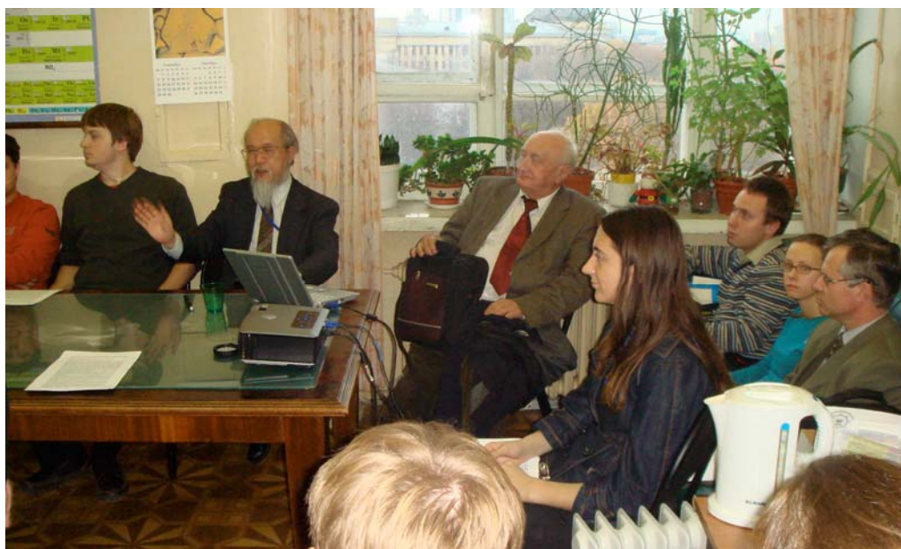
Lomonosov Moscow State University, Department of Materials Science.